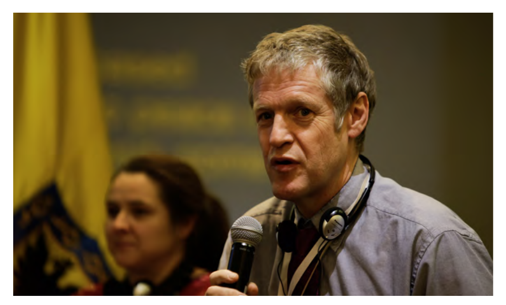
The above assumes: